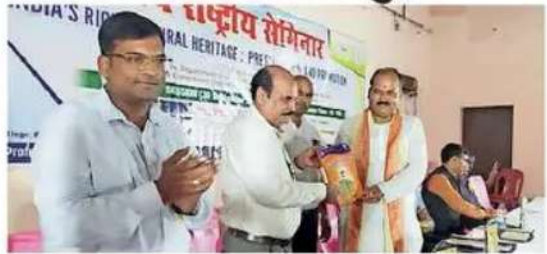
राष्ट्रीय सेमिनार में मानिंद।