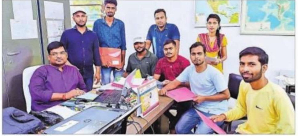
बैठक में मौजूद लोग.