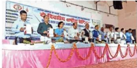
पुस्तक का विमोचन करते मुख्य अतिथि